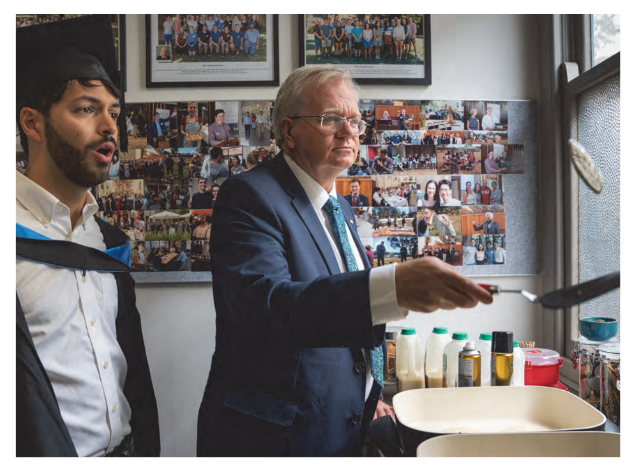
The Vice-Chancellor flipping pancakes at Graduation Pancakes

As a Tuckwell Scholar, in addition to being a member of your residential and wider ANU community, you will also become a member of Scholars House.