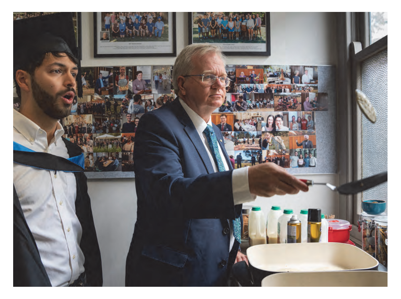
The Vice-Chancellor flipping pancakes at Graduation Pancakes

As a Tuckwell Scholar, in addition to being a member of your residential and wider ANU community, you will also become a member of Scholars House.